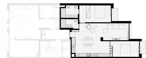
LEVEL 2 - APARTMENT 2B